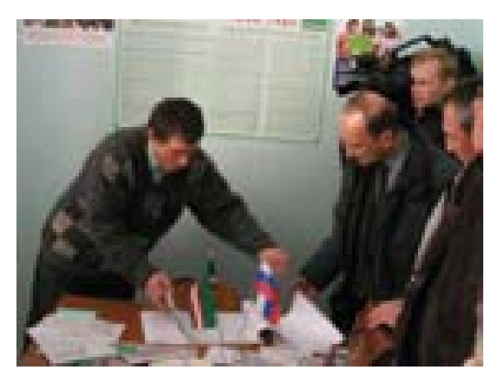
Experts from the OSCE's Office for Democratic Institutions and Human Rights and from the Council of Europe examine preparations for the 23 March referendum in a polling station in Grozny, Chechnya, during an assessment visit on 3 March.

In 2003, the ODIHR intensified its efforts to promote electoral reform, building upon a growing body of electoral law reviews conducted during the past five years. Through assisting participating States to bring their legal frameworks into line with OSCE commitments for democratic elections, the ODIHR has been able to ensure an improved legal framework in some participating States. Electoral legislation that does not fully comply with OSCE commitments is not conducive to the conduct of democratic elections, and the ODIHR cannot guarantee that a sufficient number of its recommendations are always taken into account.