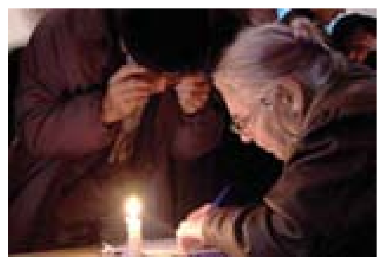
An election official checking a voter's registration by candlelight at a polling station in Khobi during Georgian parliamentary elections on 2 November.