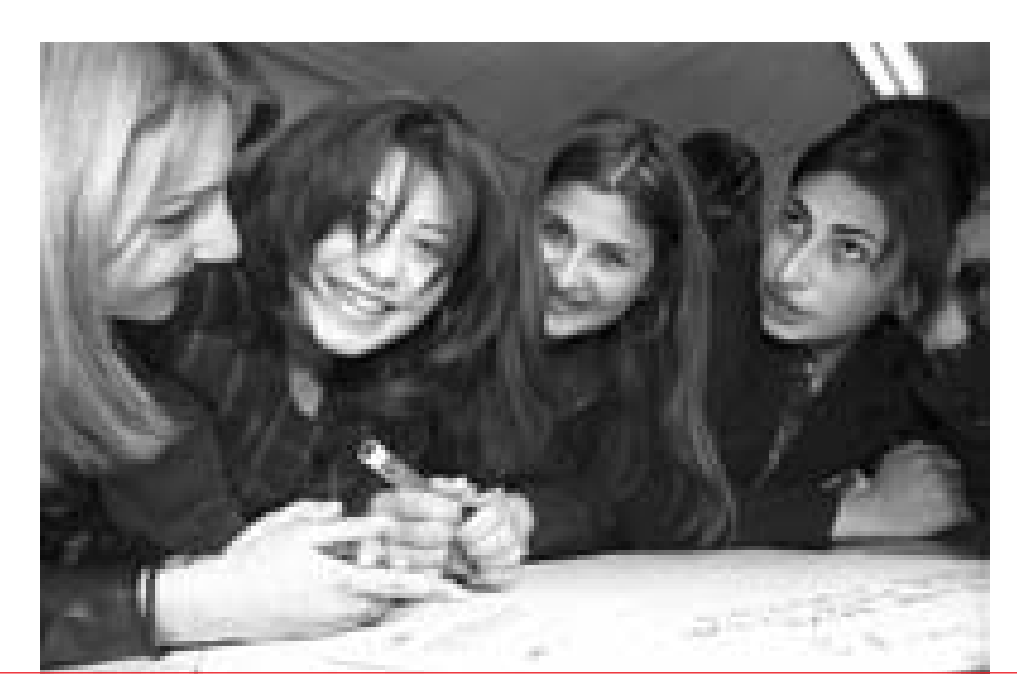
Four college students take part in an ODIHR training session on women's rights and participation in decision-making that was held in the Armavir Marz region of Armenia in April.