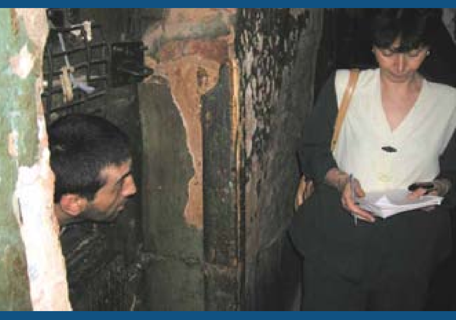
The Office for Democratic Institutions and Human Rights supports the Georgian ombudsman in deploying monitoring teams to prisons and police stations.